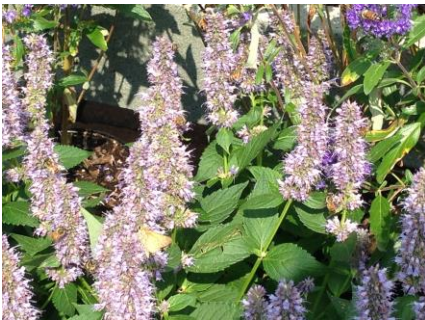
Ten bees and a Skipper forage on Agastache in a pot

The Audubon at Home program encourages you to beautify and increase the wildlife value of these small spaces. Although much of this content is directed to container gardening, patios and “pocket gardens” are merely larger extensions of the same concept, with the possible advantage of natural soils that need less additional replenishment.